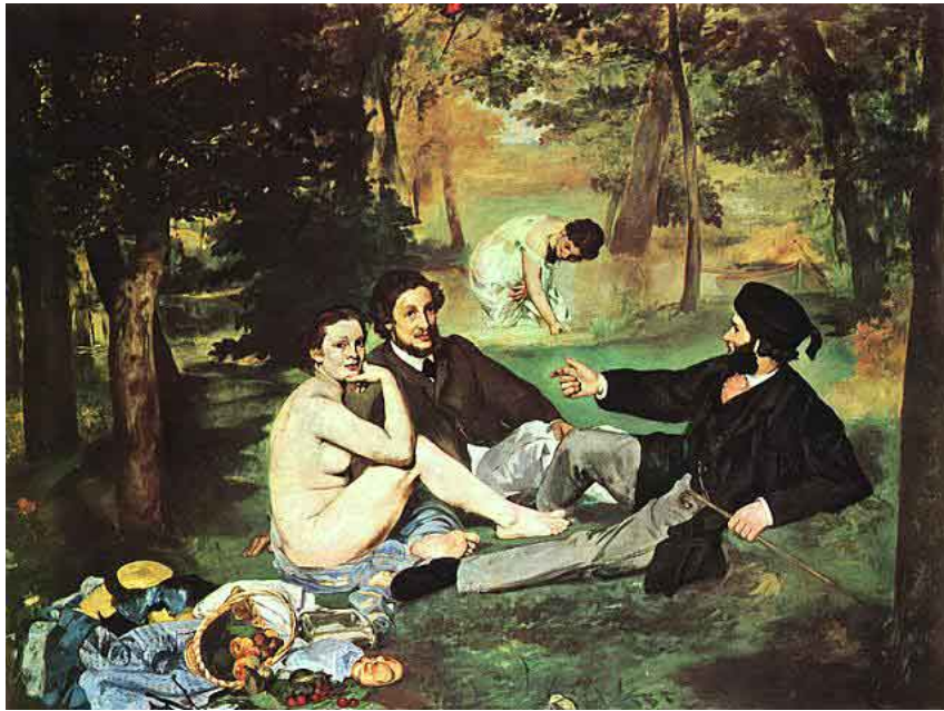
Manet's Le Déjeuner sur l'herbe