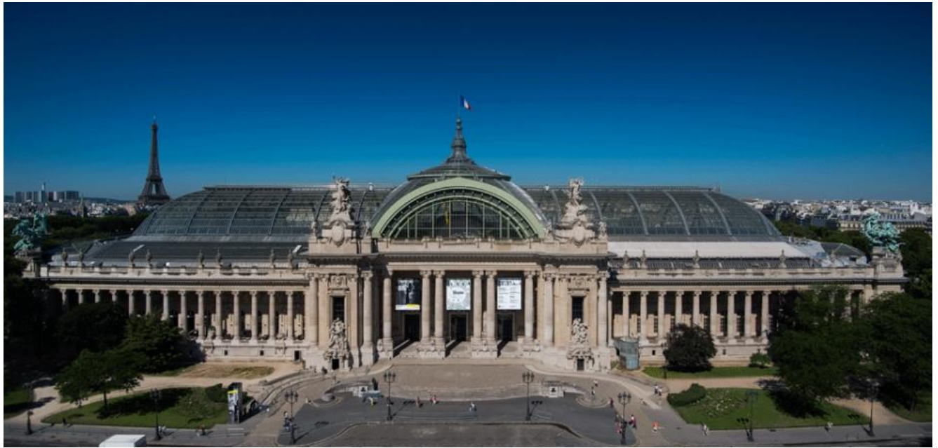
Grand Palais des Champs-Élysées