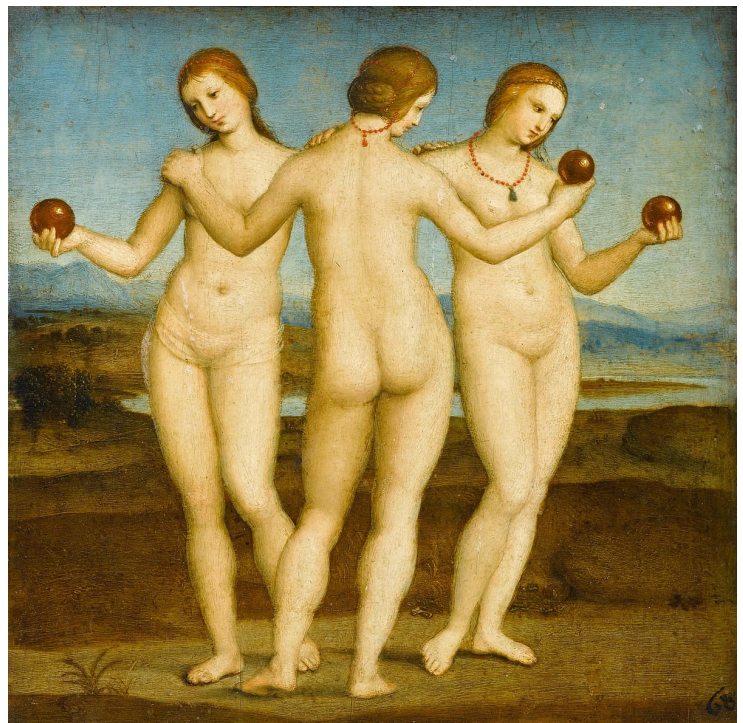
Raphael's Three Graces