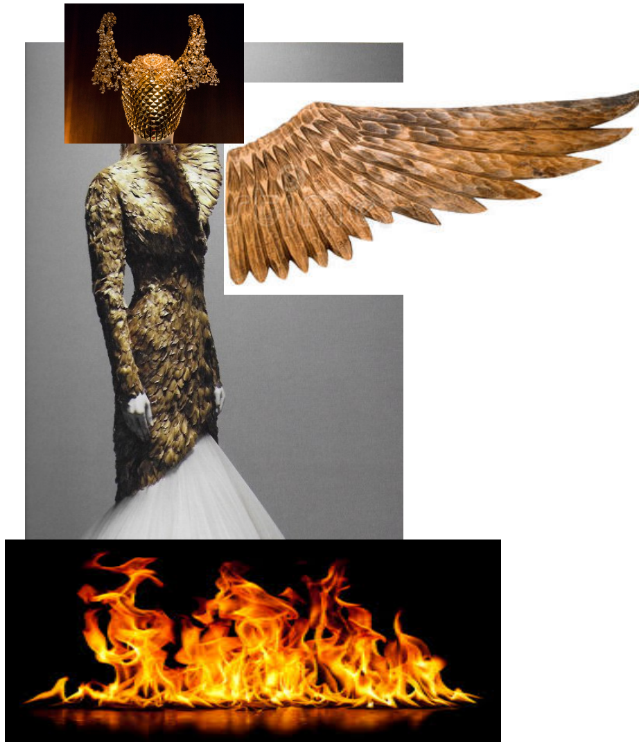
Kat in Lareine's masterpiece